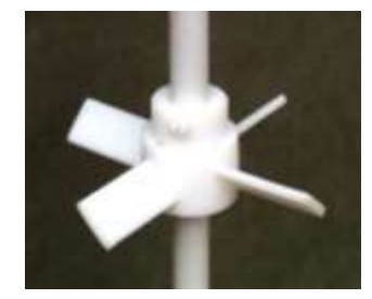
Pure Teflon Turbine Mixers

DRUM-MATES® Inc. Process Equipment Div. E: info@drummates.com, T: 609-261-1033, F: 609-261-1034